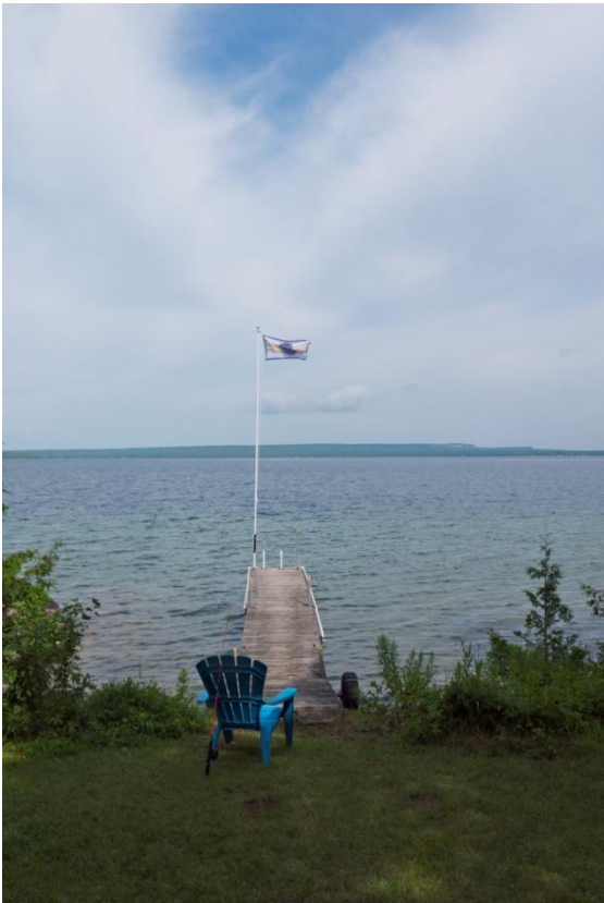
LMAA President’s Cottage on Frank’s Road

In late summer a call was put out to members to send in pictures of their LMAA Flags flying at their cottage. The “flag” is the most recent addition to the LMAA apparel line available for purchase by members. In total, 25 members purchased flags. These are the pictures we received. In the March issue of “Windswept” members will be solicited again to see if enough exists among members to place a second order of flags. Hopefully next summer more will be noticed flying around the lake!