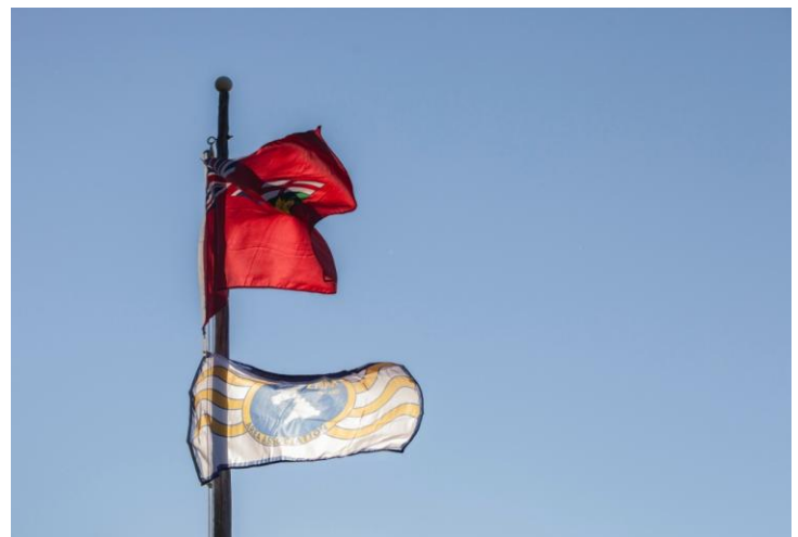
Costigan Cottage in Eagle’s Nest Bay Area