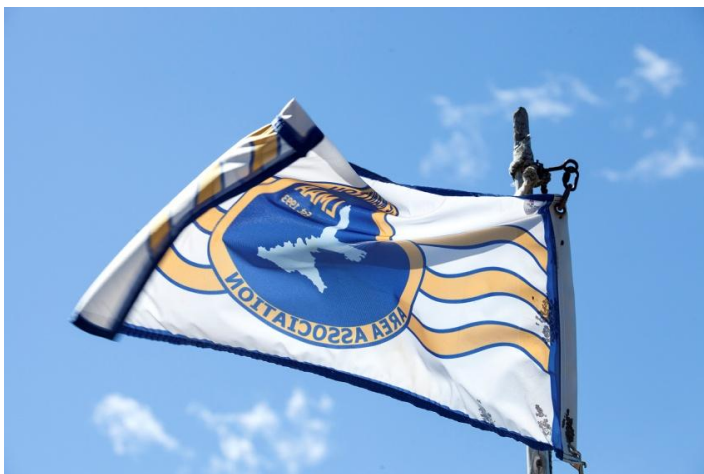
Sabine Cottage in Eagle’s Nest Bay Area